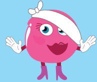
Miss Oh No