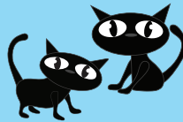
The Black Cats

casts spells on gold letters to change their sound. ★ ★ ★ wa n ts sa i d lo v e