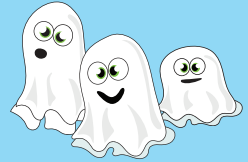
The Silent Ghosts

are the silent letters, they make no sound. wh e n fr i end kn ow