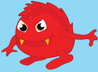
Angry Red A