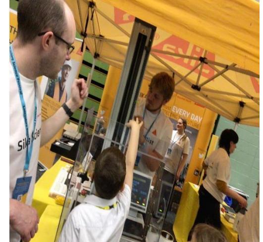
A fantastic day for Y1/2 at the Lancashire Science Festival!